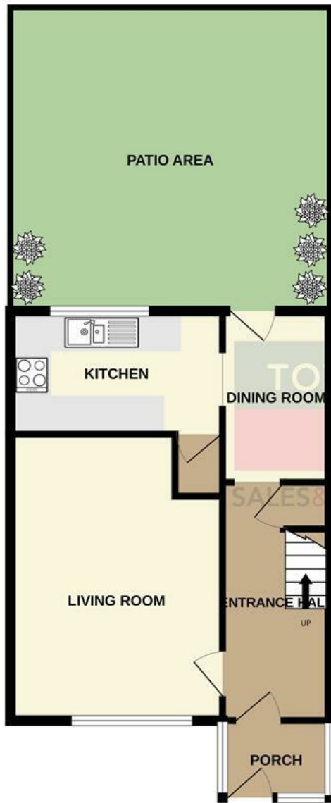
GROUND FLOOR 435 sq.ft. (40.4 sq.m.) approx.